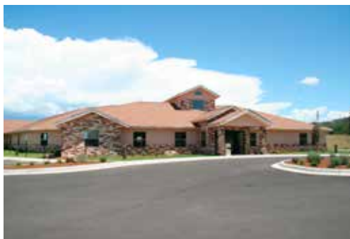
COTTONWOOD INN REHABILITATION AND EXTENDED CARE CENTER 450 Prospector Avenue 970.828.1414