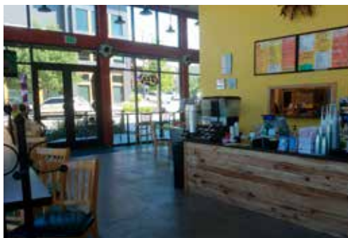
TACO BOY FRESH MEXICAN FOOD 150 Confluence Avenue, #101C 970.422.8399