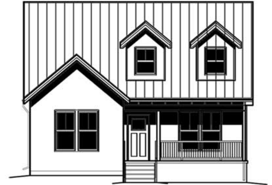
NORTHERN NEW MEXICO