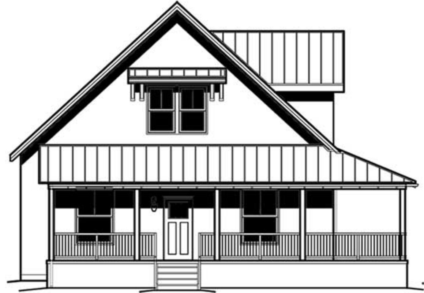
NORTHERN NEW MEXICO