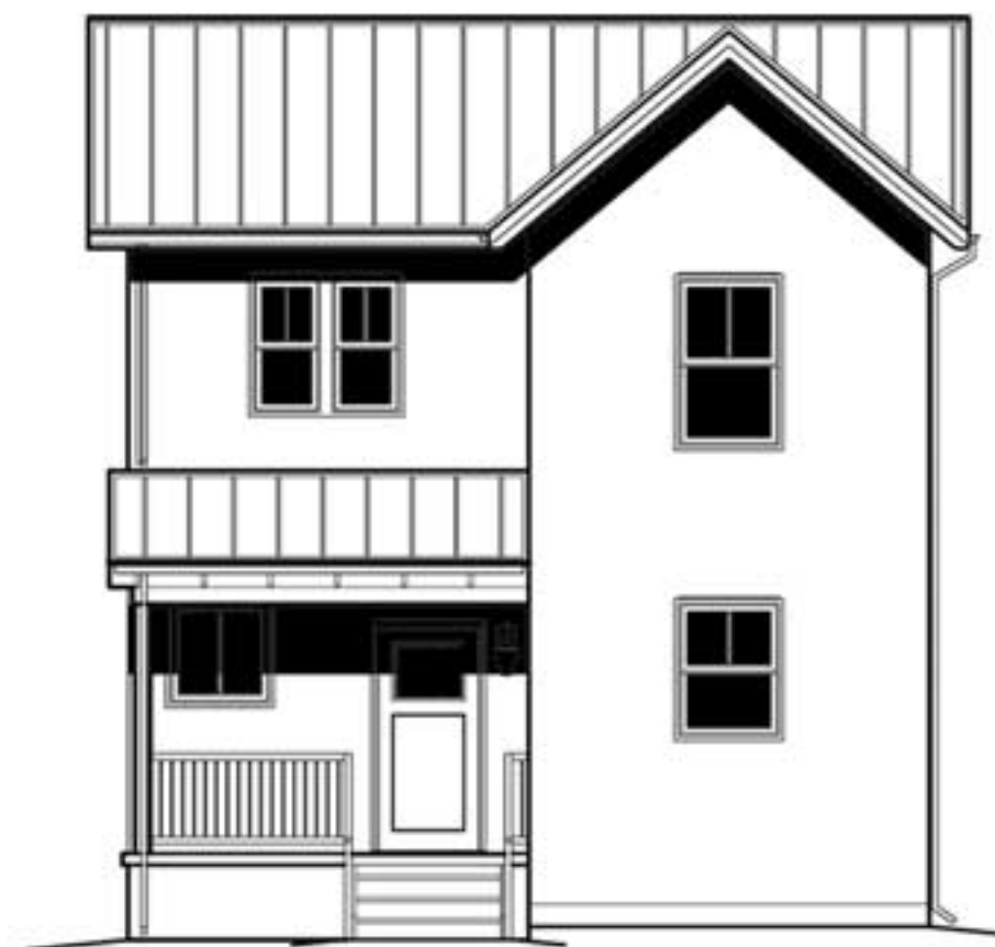
NORTHERN NEW MEXICO