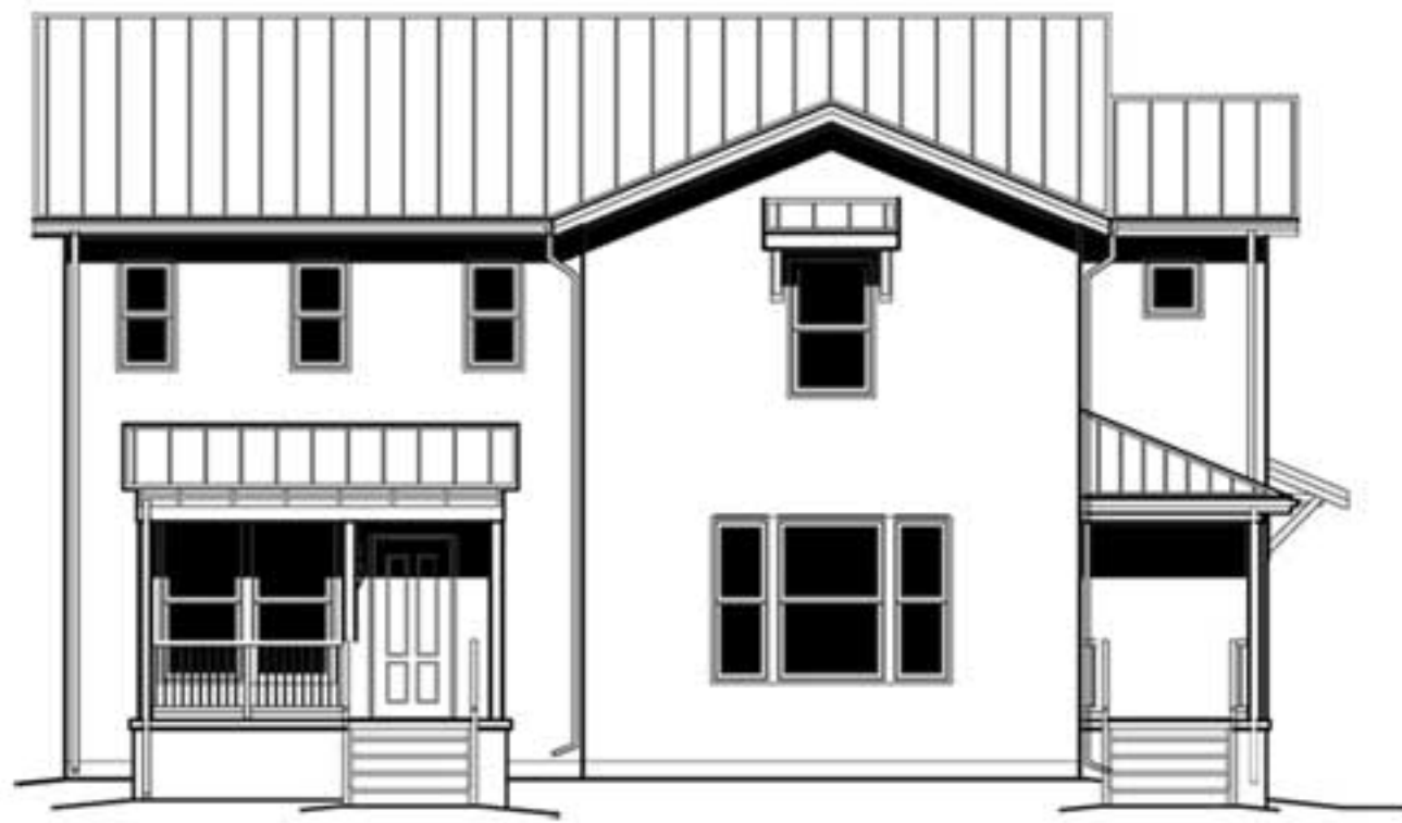
NORTHERN NEW MEXICO